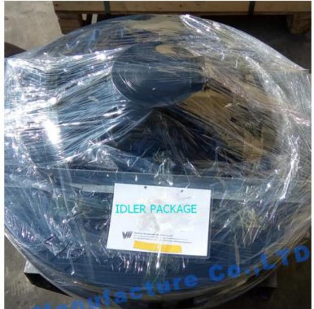
Each Package is wrapped in Thin film, and put shipping marks on the packages.