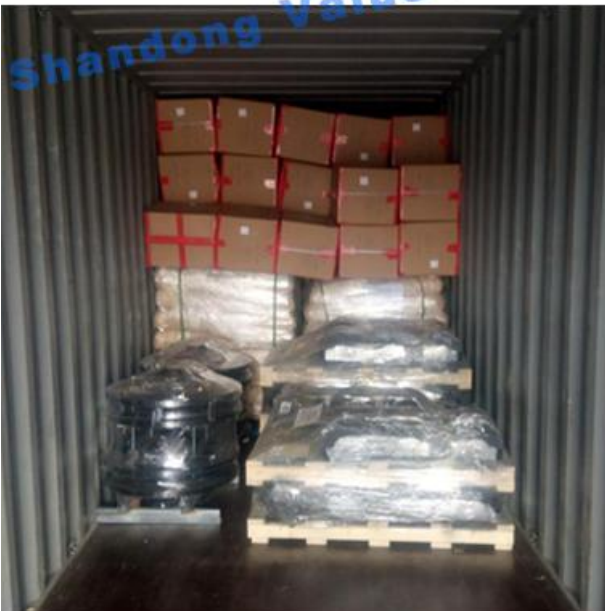
Parts in the Container