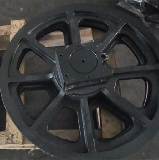
2pcs Sprockets are packed in one Pallet