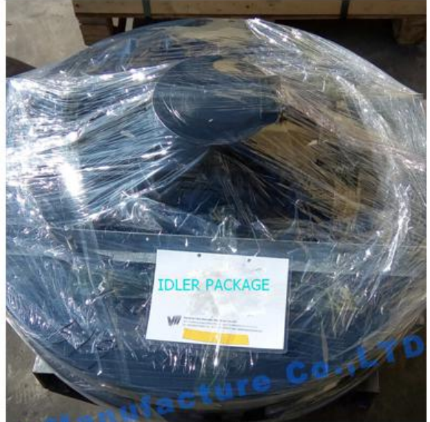
Each Package is wrapped in Thin film, and put shipping marks on the packages.