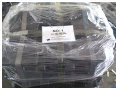
Each Pallet Covered With Thin Film and Sticker