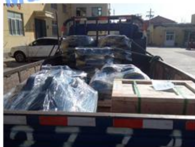
Parts are delivered to Port