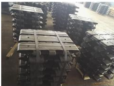
20pcs or 22pcs Track Shoes Each Pallet