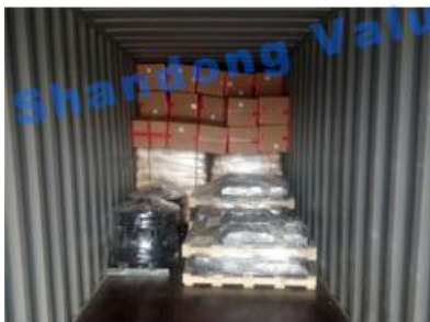
Parts in the Container